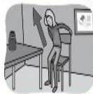
8 stand up