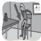
9 sit down