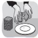
3 break off