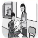
7 hand in