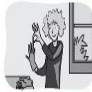
5 take off