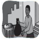
6 take out