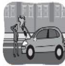
1 break down

take out take off put on sit down break down break into break off stand up hand in