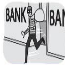
2 break into