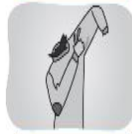
4 put on