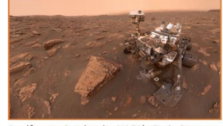
A self-portrait taken by NASA's Curiosity rover.