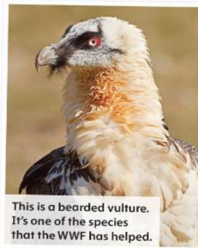
This is a bearded vulture. It's one of the species that the WWF has helped.

A Unfortunately, people 4 didn't kill (not kill) the birds by accident. People hunted the birds with guns and poison.